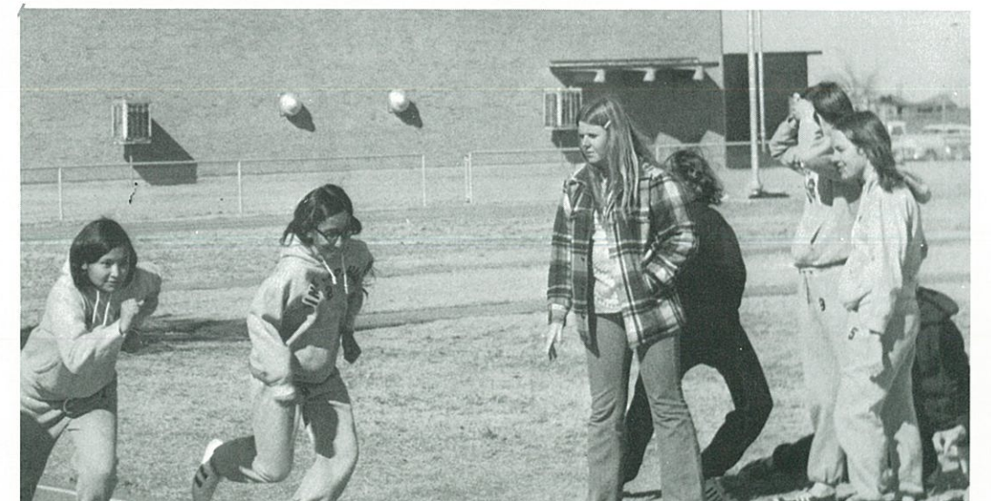
"Your shoe is untied."