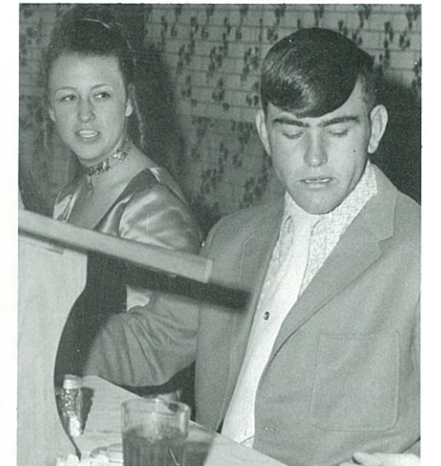
"Don't eat your peas with a spoon."