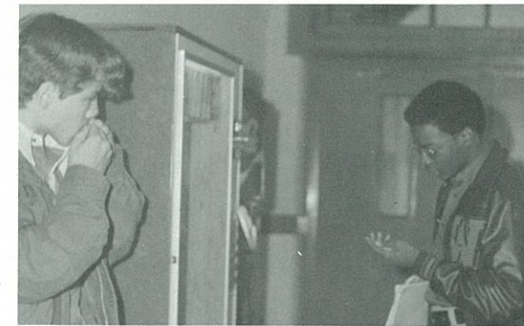
"I've been taken!"