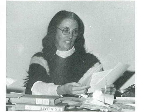
"Your mother wrote this excuse?"