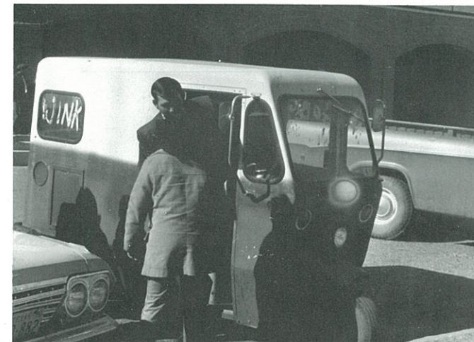
"Do you deliver?"